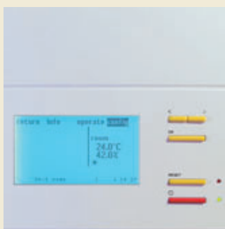
C7000 Advanced user interface

5) Condenser for type A units with R407C, ambient temperature: 32°C