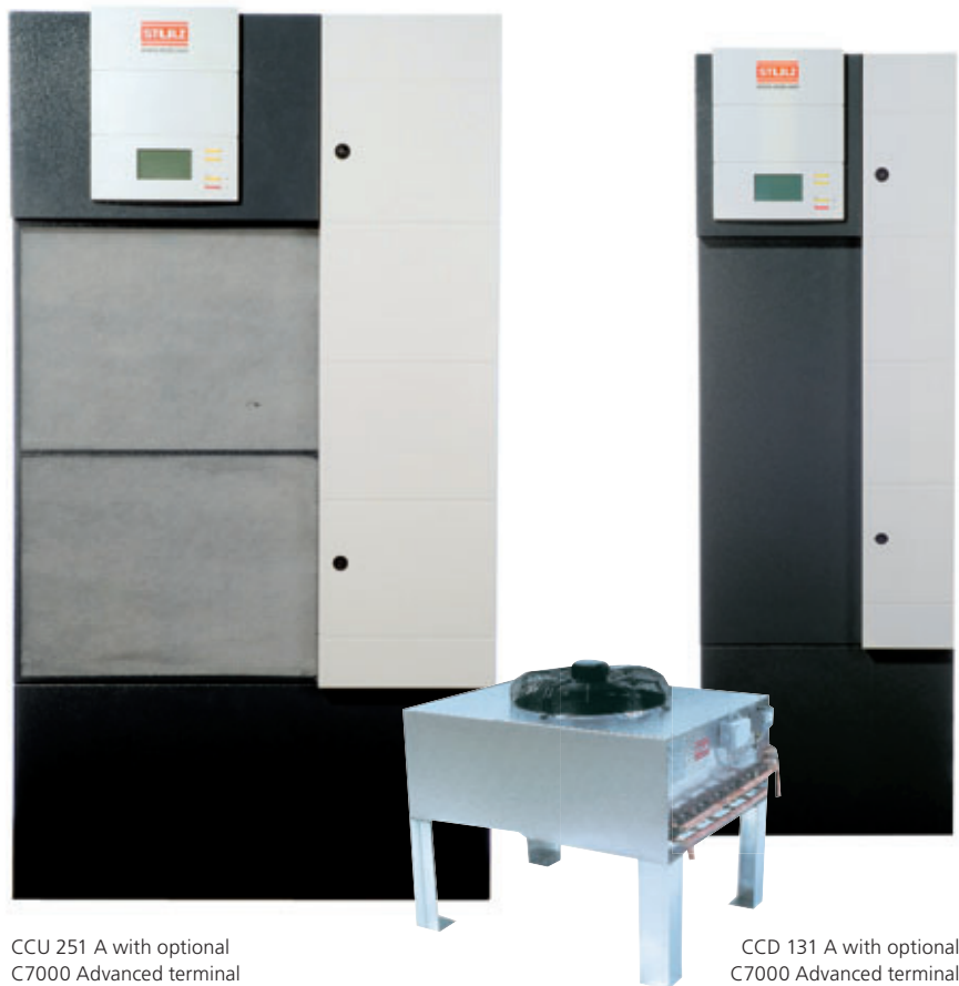
CCU 251 A with optional C7000 Advanced terminal

Unlike comfort air-conditioning units, which are not designed for permanent operation, MiniSpace with its microprocessor control ensures a precisely defined climate within narrow tolerances around the clock, 365 days a year.