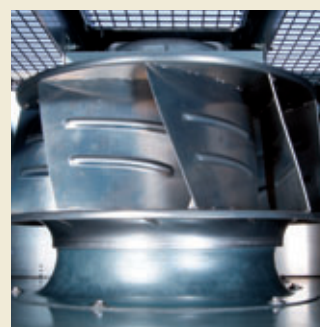
Maintenance-free EC fan