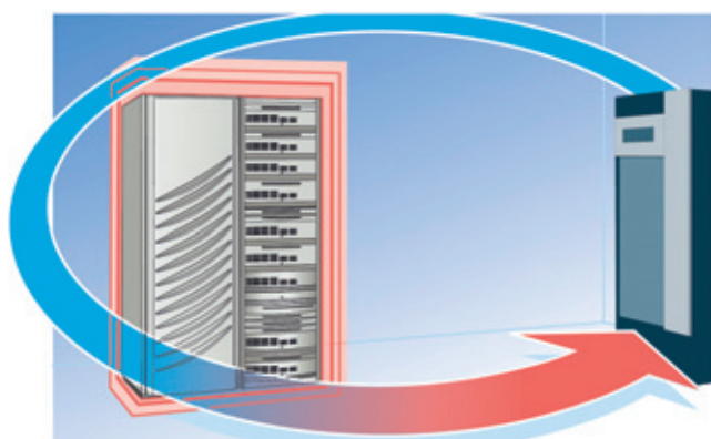
Precision air conditioning unit: air output 300 m 3 /h per kW