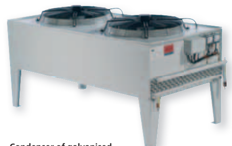
Condenser of galvanised, powder-coated sheet steel.